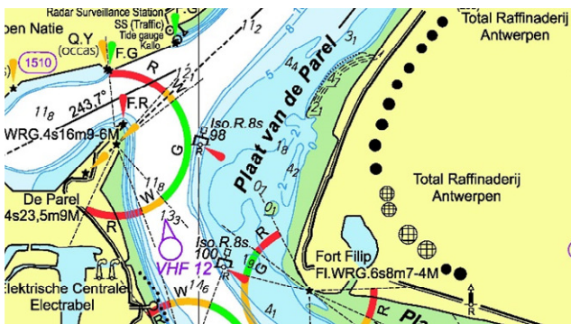
Image size 84,1 x 46,4 mm. \lfloor 51^{\circ}15,39'N 004^{\circ}17,26'E \rfloor 51^{\circ}16,15'N 004^{\circ}19,43'E